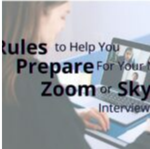
Rules to help you prepare for your next Zoom or Skype interview