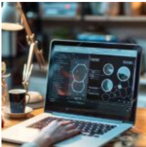
Comprehensive Guide to Resume Format for Job: How to Choose and Customize for Your Job Application