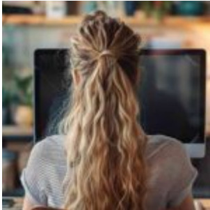
Comprehensive Guide to Free CV Creator: How to Create and Customize a Professional CV Online