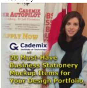
20 Must-Have Business Stationery Mockup Items for Your Design Portfolio