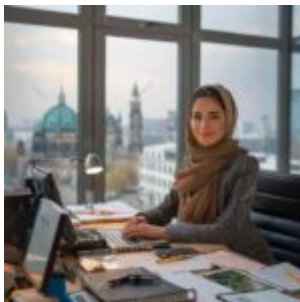
Protecting Candidates: Navigating the Legal Minefield of Job Offers