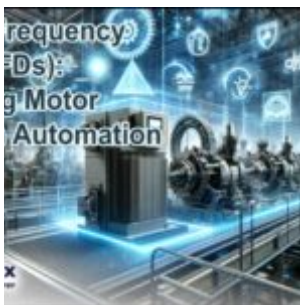
Variable Frequency Drives (VFDs): Enhancing Motor Control in Automation