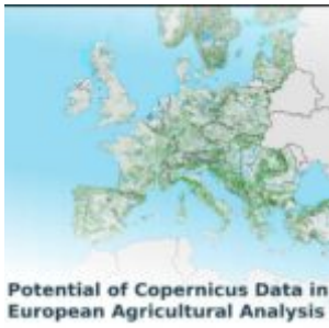
Exploring the Potential of Copernicus Data in European Agricultural Analysis