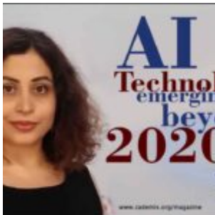
AI Technologies emerging beyond 2020