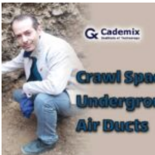
Crawl Space or Underground Air Duct ?