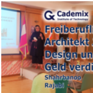
Freiberuflicher Architektenjob, Design und Geld verdienen