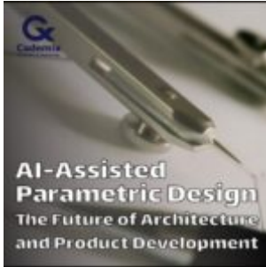
AI-Assisted Parametric Design: The Future of Architecture and Product Development