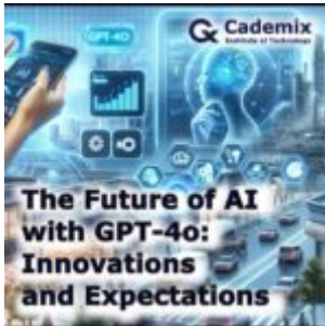
The Future of AI with GPT-4o: Innovations and Expectations