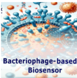
How can bacteriophage-based biosensors identify cancer quickly?