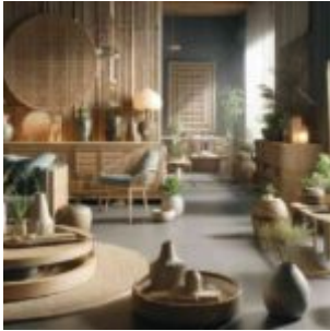
Great Interior Designers Strategies Using Cross- Functional Team Collaboration