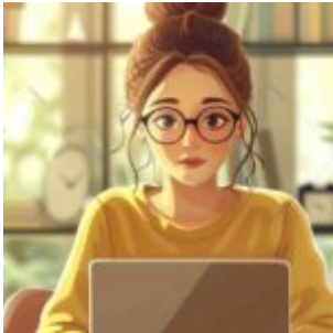
Comprehensive Guide to Free CV Template Word: How to Find, Download, and Customize Them