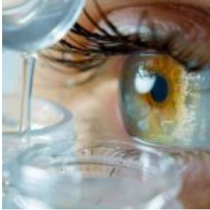
Red Contact Lenses: Stylish Choices and Essential Safety Tips