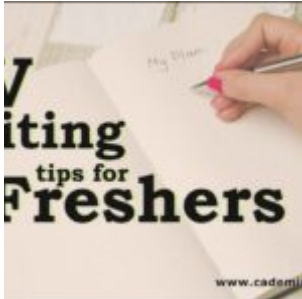
CV writing tips for freshers