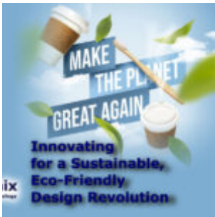
Innovating for a Sustainable, Eco-Friendly Design Revolution