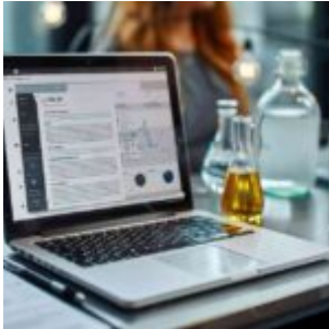
Comprehensive Guide to CV Format Free: How to Create, Customize, and Use Free CV Templates for Job A...