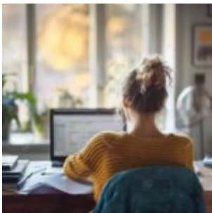
Indeed Optometrist: Finding Optometrist Jobs on Indeed