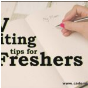
CV writing tips for freshers