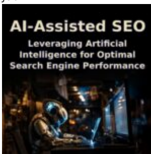
AI-Assisted SEO: Leveraging Artificial Intelligence for Optimal Search Engine Performance