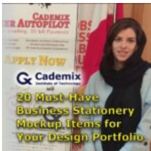
20 Must-Have Business Stationery Mockup Items for Your Design Portfolio