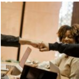
Career Development Plan during Covid-19