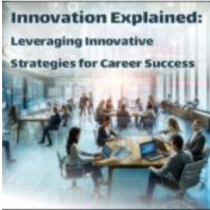
Innovation Explained: Leveraging Innovative Strategies for Career Success