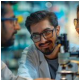
Walk-In Eye Exams: What to Look for and Critical Considerations