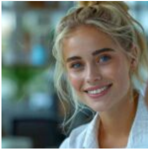
Acuvue Moist: The Ultimate Guide to Daily Comfort and Clear Vision