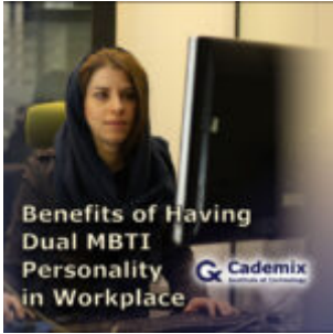
Benefits of Having Dual MBTI Personality in Workplace