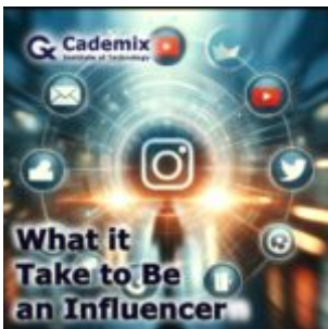
What It Takes to Be an Influencer