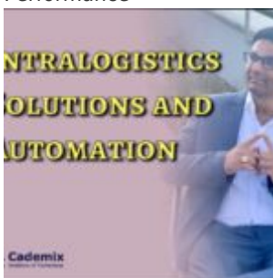
Intralogistics Solutions and Automation