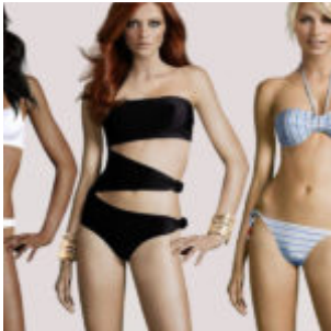
When Fashion "Models" be replaced by AI and Robots?