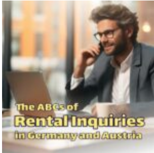
The ABCs of Rental Inquiries in Germany and Austria: Effective Communication Tactics with Landlords