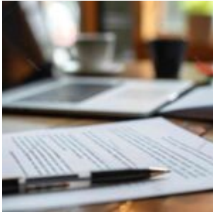
Comprehensive Guide to CV Cover Letter Templates: How to Create, Customize, and Use Professional Cov...