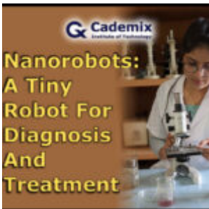
Nanorobots: A Tiny Robot For Diagnosis And Treatment