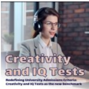
Redefining University Admissions Criteria: Creativity and IQ Tests as the New Benchmark