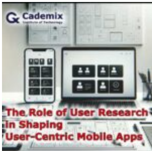
The User Research Role in Shaping User-Centric Mobile Apps