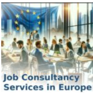
Job Consultancy Services in Europe