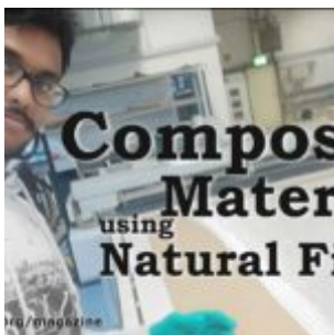
Enhancing of the Composite Materials using Natural Fibers