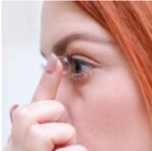
Everything You Need to Know About Contact Lenses