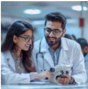
How to Become an Optometrist: A Comprehensive Guide for Job Seekers