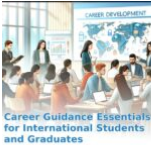
Career Guidance Essentials for International Students and Graduates