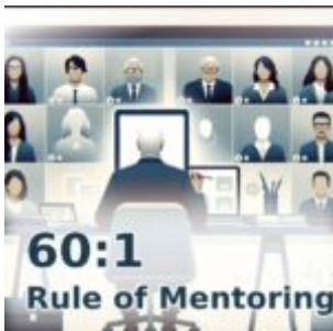
The 60:1 Rule for Self-Driven Success: The Rationale Behind 60 Minutes of Self-Work Per Mentoring Mi...