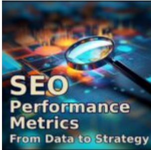
SEO Performance Metrics: From Data to Strategy