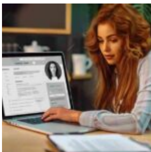
Comprehensive Guide to CV Format Word: How to Choose and Customize for Job Applications