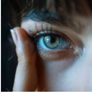
Biofinity Contact Lenses: A Guide to Comfort and Performance