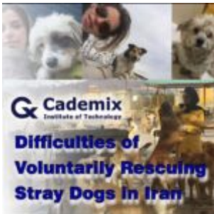
Difficulties of Voluntarily Rescuing Stray Dogs in Iran