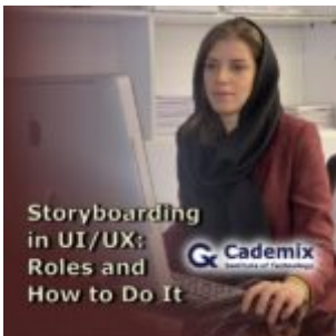
Storyboarding in UI/UX: Roles and How to Do It