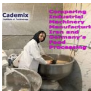
Comparing Industrial Machinery Manufacturing Iran and Germany's Food Processing