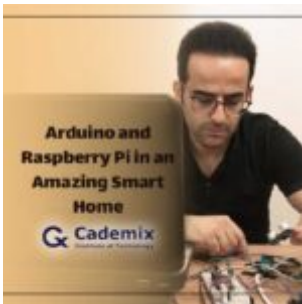
Arduino and Raspberry Pi in an Amazing Smart Home