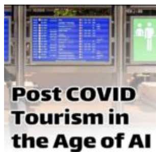
Post-COVID Tourism in the Age of AI