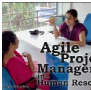
HR Agile Management - Agile Project Management in Human Resource