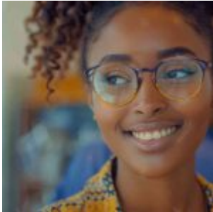
Exploring Remote Optometry Jobs: Opportunities, Responsibilities, and Benefits