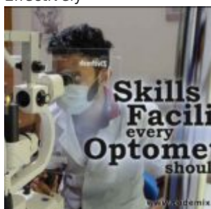
Top Skills and Facilities Every Optometrist Should Know