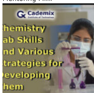
Chemistry Lab Skills and Various Strategies for Developing Them