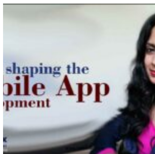
How AI is Shaping Mobile App Development