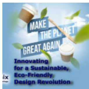
Innovating for a Sustainable, Eco-Friendly Design Revolution