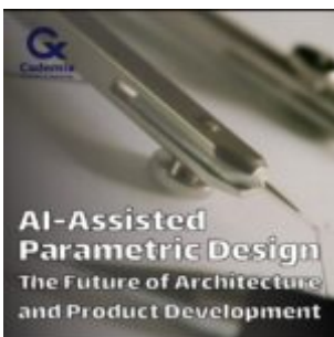
AI-Assisted Parametric Design: The Future of Architecture and Product Development