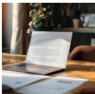
Comprehensive Guide to Resume Template Word Free Download: How to Choose and Use Them Effectively