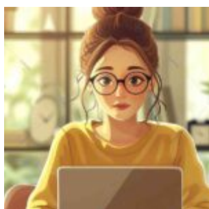
Comprehensive Guide to Free CV Template Word: How to Find, Download, and Customize Them