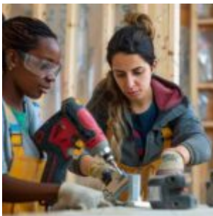
Prescription Safety Glasses: Ensuring Protection and Clear Vision