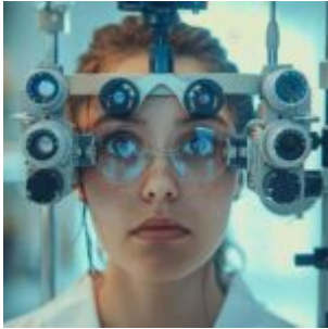
Phoropter - Essential Tool in Optometry