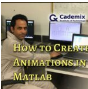
How to create animation in Matlab?