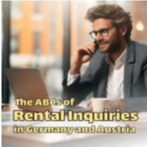
The ABCs of Rental Inquiries in Germany and Austria: Effective Communication Tactics with Landlords