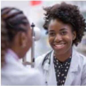
Finding the Best Vision Centers Near Me: A Critical Review