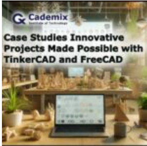
Case Studies Innovative Projects Made Possible with TinkerCAD and FreeCAD