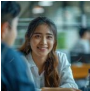
Acuvue Oasys for Astigmatism Daily: A Comprehensive Overview