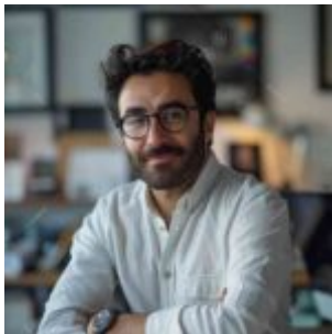
Legal Careers in Europe: Opportunities for International Lawyers