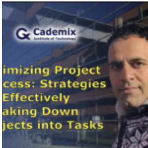
Optimizing Project Success: Strategies for Effectively Breaking Down Projects into Tasks