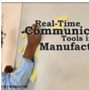
Real-Time Communication Tools in Manufacturing Sector