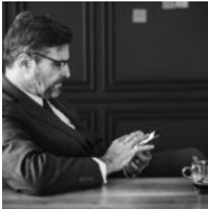
Establishing an Eye Center: Business Models and Key Considerations for Business Owners and Investors