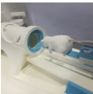
Low cost & Portable MRI Systems - A step toward democratization of Health Care