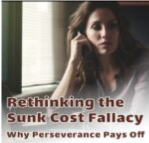
Rethinking the Sunk Cost Fallacy : Why Perseverance Pays Off