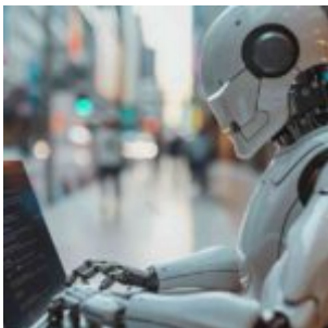
Leveraging GPT and AI for Career Coaching and Professional Development