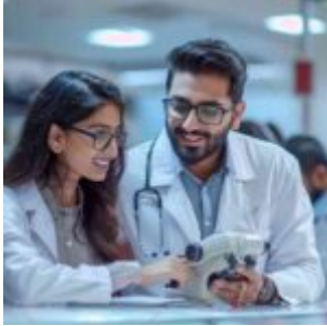
How to Become an Optometrist: A Comprehensive Guide for Job Seekers