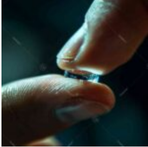
Oasys Contact Lenses: A Detailed Review of Their Advantages and Disadvantages