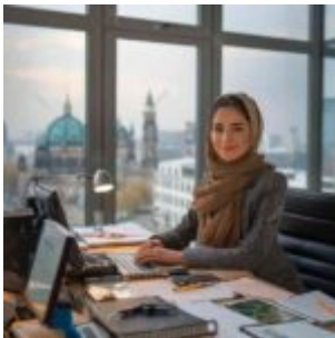
Protecting Candidates: Navigating the Legal Minefield of Job Offers