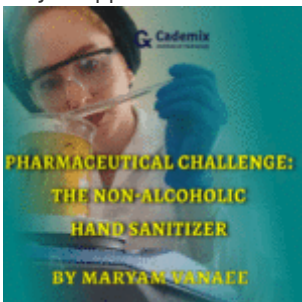
Pharmaceutical challenge: the non-alcoholic hand sanitizer