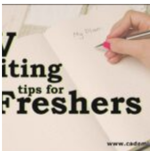
CV writing tips for freshers