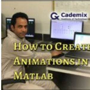
How to create animation in Matlab?