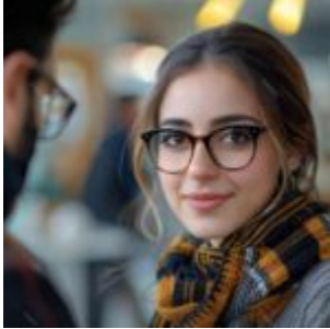
Prescription Glasses: From Eye Examination to Stylish Eyewear