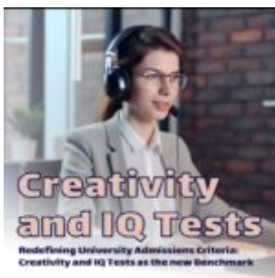
Redefining University Admissions Criteria: Creativity and IQ Tests as the New Benchmark