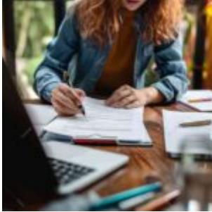
Conditional Offers and Legal Pitfalls: Ensuring Fairness in Recruitment