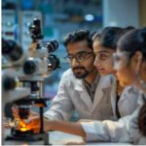
Optometrist Looking for Work: A Comprehensive Job Search Guide