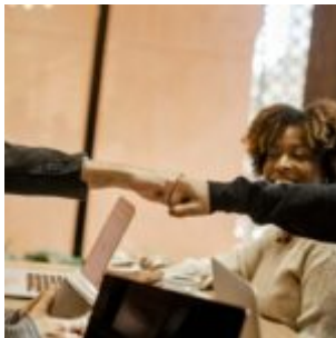
Career Development Plan during Covid-19