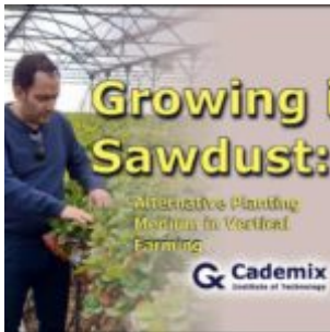
Growing in Sawdust: Alternative Planting Medium in Vertical Farming