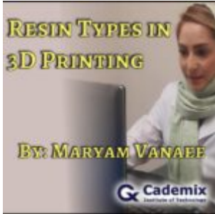
Resin Types in 3D Printing