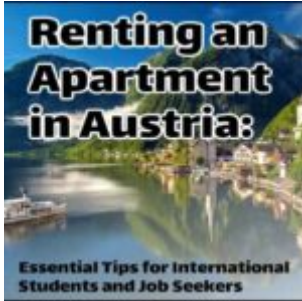
Renting an Apartment in Austria: Essential Tips for International Students and Job Seekers