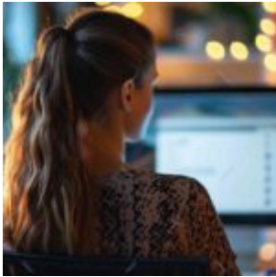
Comprehensive Guide to Resume Template Download: How to Find, Download, and Customize for Job Applic...