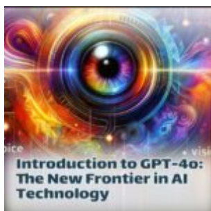
Introduction to GPT-4o: The New Frontier in AI Technology