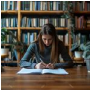
Comprehensive Guide to the Best Resume Format: How to Choose and Use Them Effectively