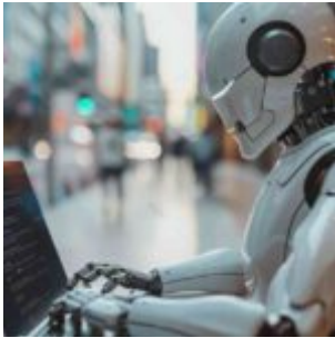
Leveraging GPT and AI for Career Coaching and Professional Development