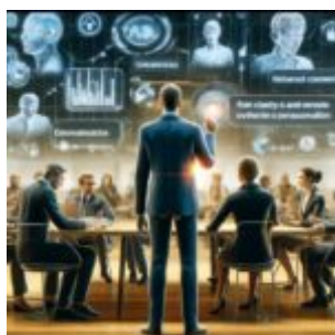
Comprehensive Guide to Walk In Interview: How to Prepare, Succeed, and Make a Strong Impression in W...