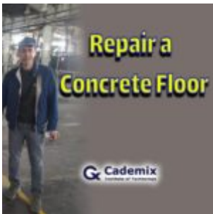
Repair a Concrete Floor