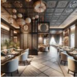
Integrating Minimalism and Human-Centered Design in Restaurant Interiors