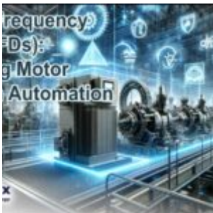
Variable Frequency Drives (VFDs): Enhancing Motor Control in Automation