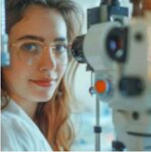
LensCrafters Eye Exam: Comprehensive Care for Your Vision Needs