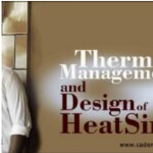
Simulation and modeling techniques for energy optimization