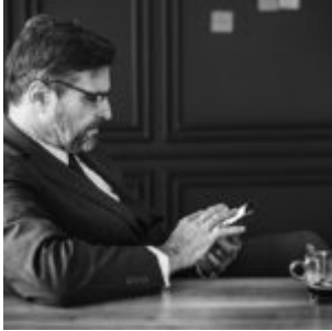
Establishing an Eye Center: Business Models and Key Considerations for Business Owners and Investors