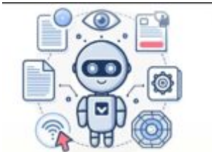
GPT-4o Enhances Text, Voice & Vision Capabilities