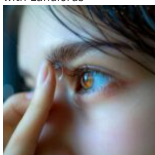
Monthly Contact Lenses: Balancing Convenience and Vision Health