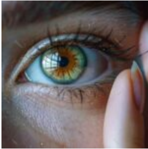
The Evolution of Color Lenses: A Journey Through History and Fashion