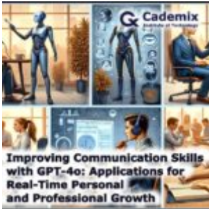
Improving Communication Skills with GPT-4o: Applications for Real-Time Personal and Professional Gro...