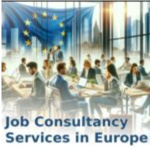
Job Consultancy Services in Europe