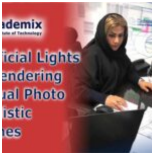
Artificial Lights in Rendering Virtual Photo Realistic Scenes