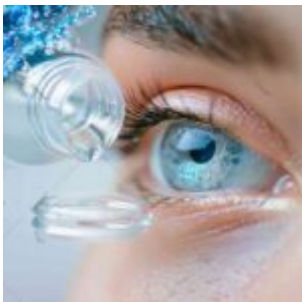
Buying Lenses Online: Benefits, Risks, and the Importance of Consulting an Eye Doctor