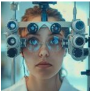
Phoropter - Essential Tool in Optometry