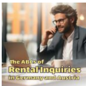
The ABCs of Rental Inquiries in Germany and Austria: Effective Communication Tactics with Landlords