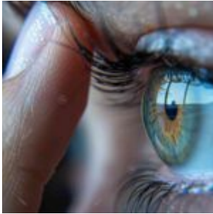
The Science Behind Bifocal Contacts: An In-Depth Look at Optics and Vision Correction