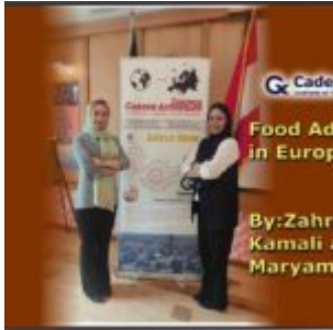
Food Additives in Europe