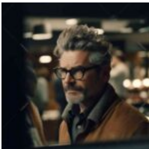
Eye Exam and Glasses Same Day Near Me: Tips for Quick and Efficient Vision Care