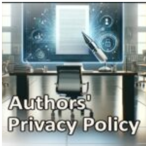
Understanding Cademix's Author Privacy Policy : A Simple Explanation