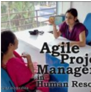
HR Agile Management - Agile Project Management in Human Resource