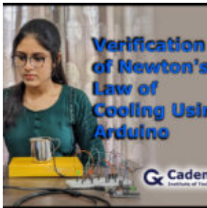
Verification of Newton's Law of Cooling Using Arduino