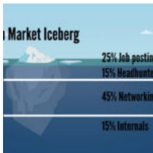
The Hidden Job Market