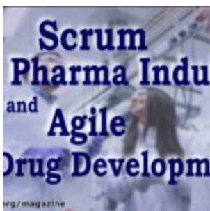
Scrum in Pharma Industry and Agile Drug Development