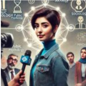
How Public Perceives Multidisciplinary Experts: Insights from Psychology and the Halo Effect