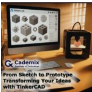
From Sketch to Prototype: Transforming Your Ideas with Tinkercad