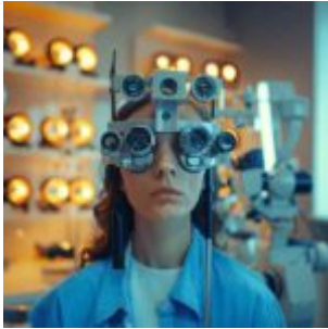
Understanding Your Eyeglass Prescription: A Comprehensive Guide