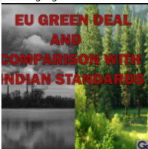
EU GREEN DEAL AND COMPARISON WITH INDIAN STANDARDS