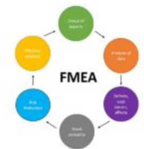
FMEA Insights in Manufacturing Industry