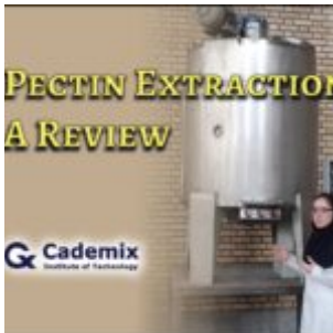
Pectin Extraction – A Review