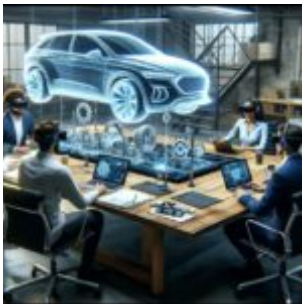
Effective Multi-Platform Communication: Integrating Email, WhatsApp, and Other Messaging Platforms