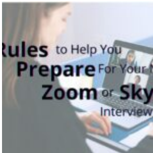
Rules to help you prepare for your next Zoom or Skype interview