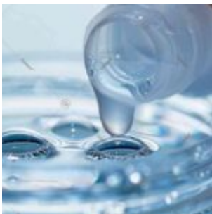
Exploring Biofinity XR: Benefits, Features, and Considerations for Users