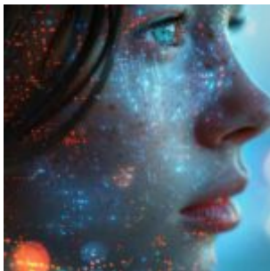
Exploring the New ChatGPT Desktop App: Features and Benefits