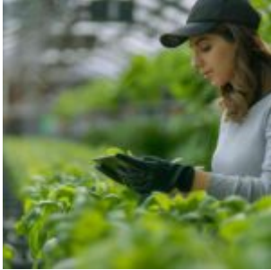
Navigating Ag Recruitment: Comprehensive Strategies for Securing Top Talent in Agriculture