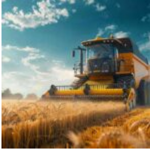
Precision Farming: Advancing Agriculture Through Technological Innovations