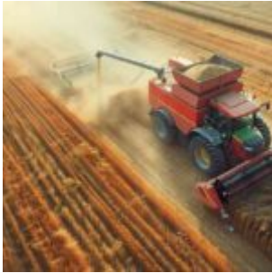
Navigating the Future of Ag Equipment: Innovations and Trends in Agricultural Machinery