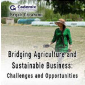
Bridging Agriculture and Sustainable Business: Challenges and Opportunities