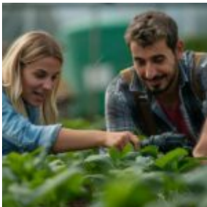
An Academic Intro to Agribusiness: Bridging the Gap Between Academia and the Agricultural Market