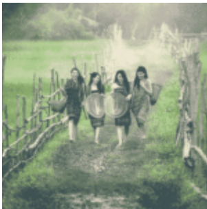
Benefits of Developing an Agriculture Website: Boosting Farm Revenue and Building Loyal Clientele