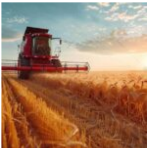
New vs. Used Farm Tractors: A Critical Analysis for Modern Farmers