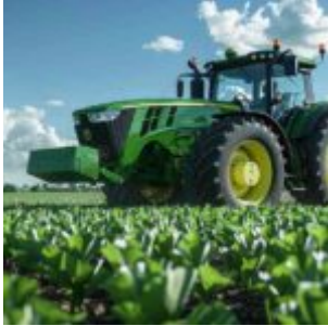
Sustainable Practices in Farm Equipment for Sale: Embracing a Circular Economy