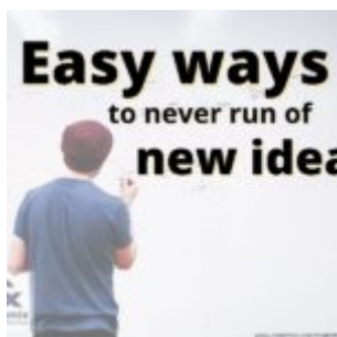
5 easy ways to never run out of new ideas