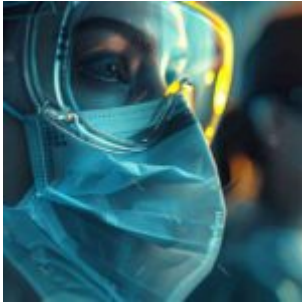
How to change jobs during a pandemic