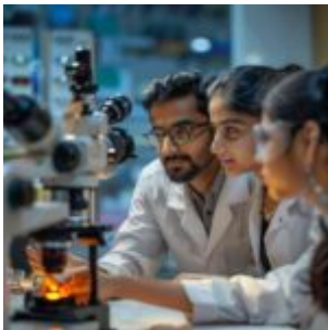
Optometrist Looking for Work: A Comprehensive Job Search Guide