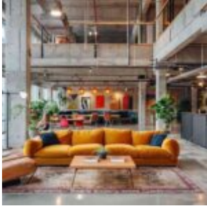
The Synergy Between Art Deco Architecture and Modern Interior Design