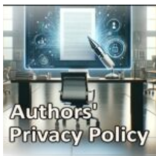
Understanding Cademix's Author Privacy Policy : A Simple Explanation