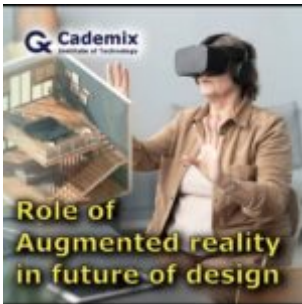
Role of Augmented Reality in the Future of Design