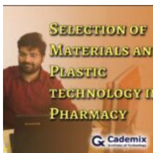
Selection of Materials and Plastic Technology in Pharma