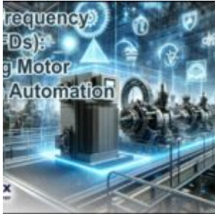
Variable Frequency Drives (VFDs): Enhancing Motor Control in Automation