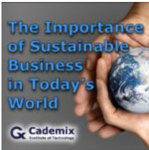
The Importance of Sustainable Business in Today's World