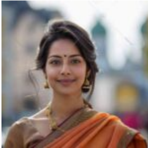
5 simple social Hacks for better likability