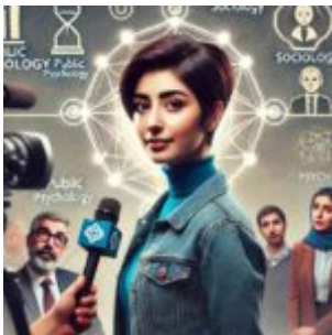
How Public Perceives Multidisciplinary Experts: Insights from Psychology and the Halo Effect