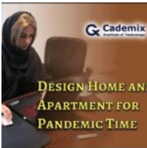
Design Home and Apartment for Pandemic Time