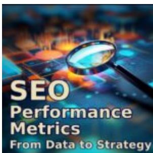
SEO Performance Metrics: From Data to Strategy