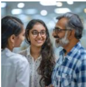
Eye Associates: Comprehensive Eye Care Services for Optimal Vision Health