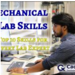
Mechanical and Lab Skills - Top 10 Skills for Every Lab Expert