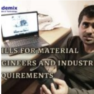
Skills for material engineers and industrial requirements