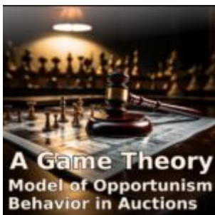
A Game Theory Model of Opportunism Behavior in Auctions