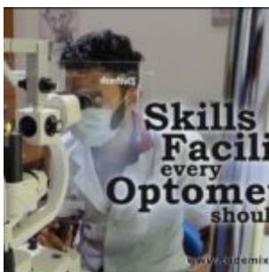
Top Skills and Facilities Every Optometrist Should Know