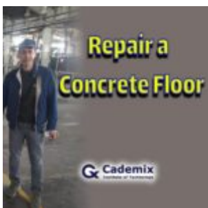
Repair a Concrete Floor