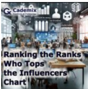
Ranking the Ranks: Who Tops the Influencer Charts?