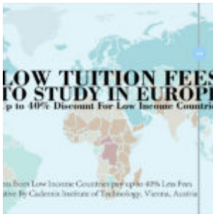
Lower Tuition Fees for Low Income Countries