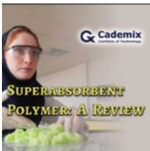
Superabsorbent Polymer – A Review