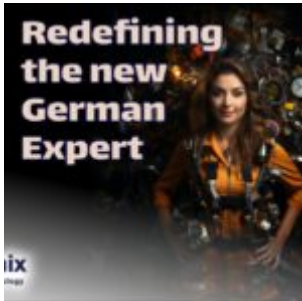
Redefining the New German Experts: From Lifelong Specialization to Cross-Functional Skills