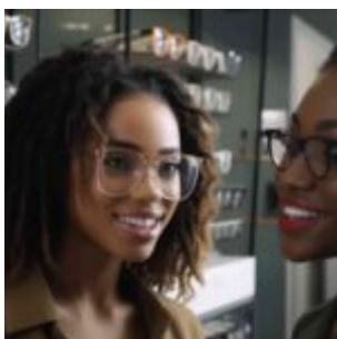
Optician Technician: A Comprehensive Guide to Roles, Responsibilities, and Career Path