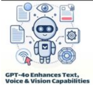
How GPT-4o Enhances Text, Voice, and Vision - GPT-4 Capabilities