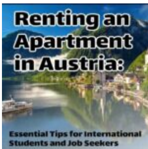
Renting an Apartment in Austria: Essential Tips for International Students and Job Seekers