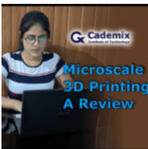
Microscale 3D Printing: A Review