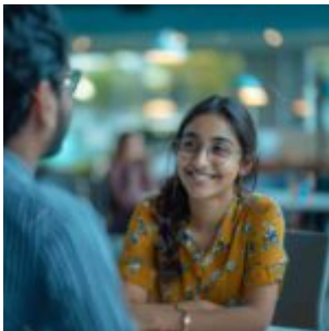
Accelerating Success: Tailored Mentorship for International Professionals in Navigating Offers