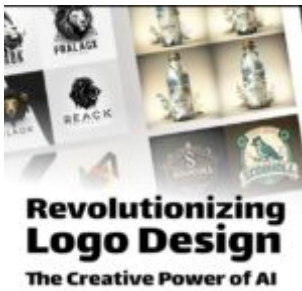
Revolutionizing Logo Design: The Creative Power of AI