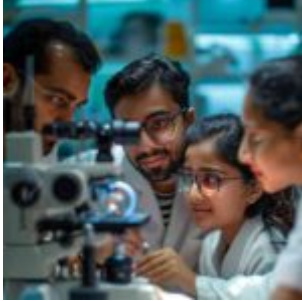
Optometrist Career Path: A Comprehensive Guide