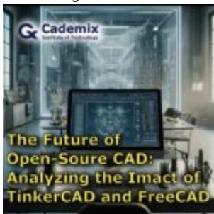
The Impact of TinkerCAD and FreeCAD in the Industry