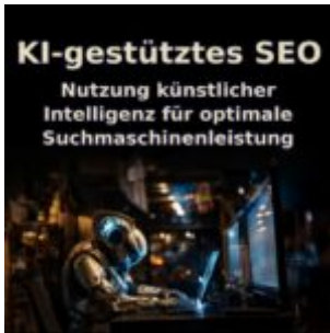
KI-gestütztes SEO: Nutzung künstlicher Intelligenz für optimale Suchmaschinenleistung