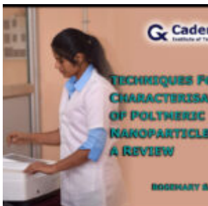
Techniques for Characterisation of Polymeric Nanoparticles: A Review