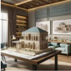
Interior Design Consultation with SketchUp as a Tool for Enhanced Client