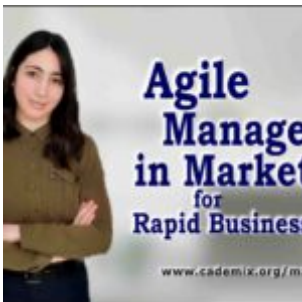
Agile Management in Marketing for Rapid Business Growth