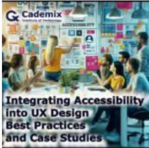
Integrating Accessibility into UX Design