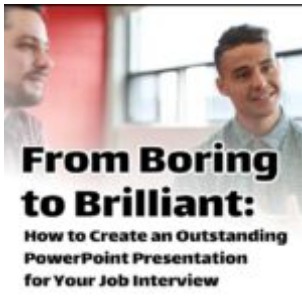
From Boring to Brilliant: How to Create an Outstanding PowerPoint Presentation for Your Job Interview...