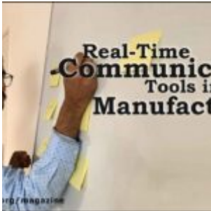
Real-Time Communication Tools in Manufacturing Sector