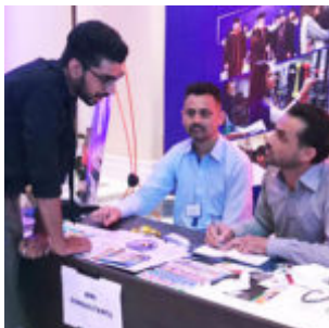
Austria : Top destination for Pakistani graduates