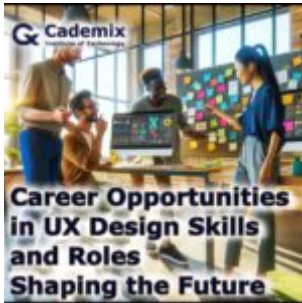
Career Opportunities in UX Design: Skills and Roles Shaping the Future