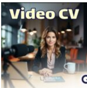
Video CV: 2023 Strategic Approach to Stand Out in the Competitive Job Market