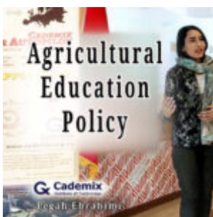
Agricultural Education Policy