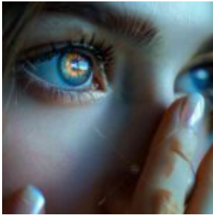
Eye Contacts: A Comprehensive Guide to Choosing and Caring for Contact Lenses