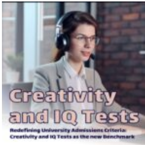
Redefining University Admissions Criteria: Creativity and IQ Tests as the New Benchmark