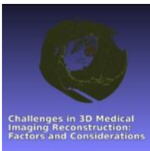
Challenges in 3D Medical Imaging Reconstruction: Factors and Considerations