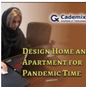
Design Home and Apartment for Pandemic Time