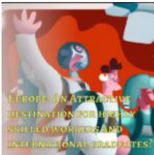
Why Europe is very attractive destination for highly skilled workers and international tech graduate...