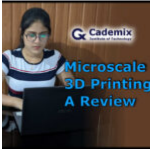
Microscale 3D Printing: A Review