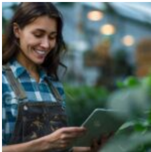
1-Day Acuvue Moist Multifocal: Convenience and Clear Vision for Presbyopia