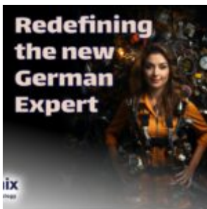
Redefining the New German Experts: From Lifelong Specialization to Cross-Functional Skills