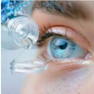
Buying Lenses Online: Benefits, Risks, and the Importance of Consulting an Eye Doctor