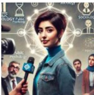
How Public Perceives Multidisciplinary Experts: Insights from Psychology and the Halo Effect