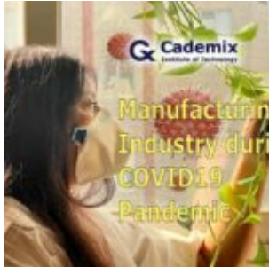
Manufacturing Industry during COVID19 Pandemic