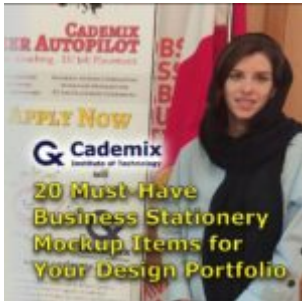
20 Must-Have Business Stationery Mockup Items for Your Design Portfolio