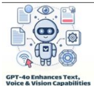
How GPT-4o Enhances Text, Voice, and Vision - GPT-4 Capabilities