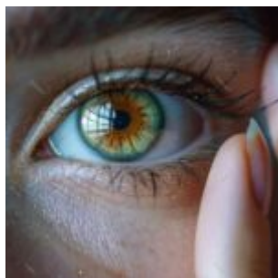
FreshLook Contacts: Exploring the Science and Technology Behind Colored Lenses