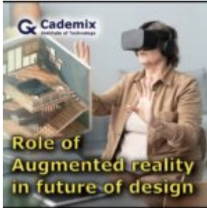
Role of Augmented Reality in the Future of Design