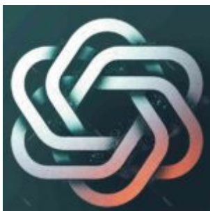
GPT-4o for Business: Transforming Workflows and Productivity