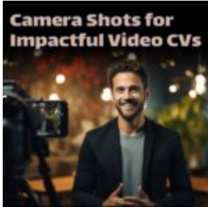
Mastering Camera Shots for Impactful Video CVs and Educational Content