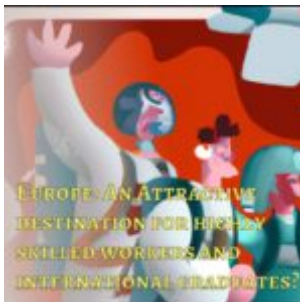
Why Europe is very attractive destination for highly skilled workers and international tech graduate...