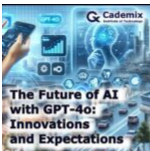
The Future of AI with GPT-4o: Innovations and Expectations