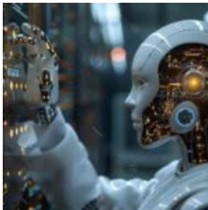
Chatgpt: Revolutionizing Conversational AI and Beyond