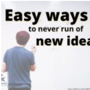
5 easy ways to never run out of new ideas