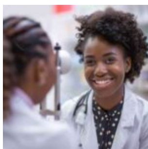
Finding the Best Vision Centers Near Me: A Critical Review