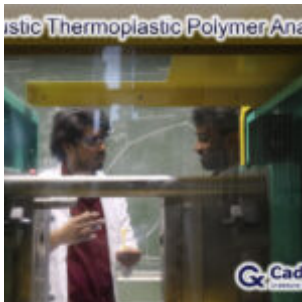
Acoustic Thermoplastic Polymer Analysis