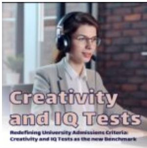
Redefining University Admissions Criteria: Creativity and IQ Tests as the New Benchmark