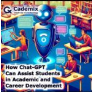
How Chat-GPT Can Assist Students in Academic and Career Development