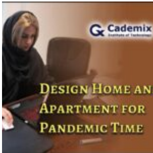
Design Home and Apartment for Pandemic Time