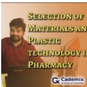
Selection of Materials and Plastic Technology in Pharma