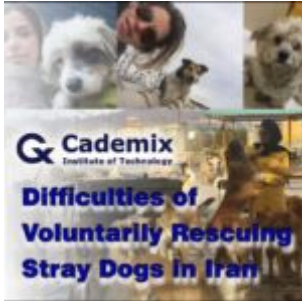
Difficulties of Voluntarily Rescuing Stray Dogs in Iran