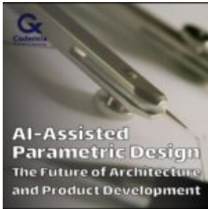
AI-Assisted Parametric Design: The Future of Architecture and Product Development