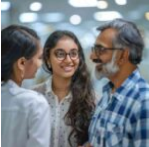
Eye Associates: Comprehensive Eye Care Services for Optimal Vision Health