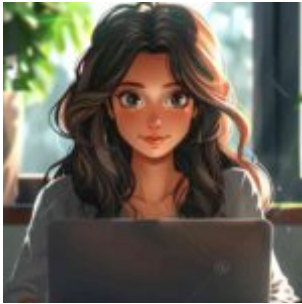
Comprehensive Guide to ATS Friendly Resume Templates: How to Optimize and Use Them Effectively