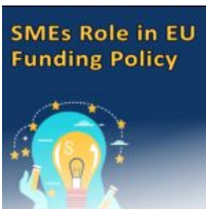
Importance of SMEs role in EU Funding policy