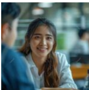
Acuvue Oasys for Astigmatism Daily: A Comprehensive Overview