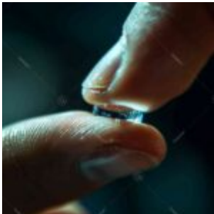
Oasys Contact Lenses: A Detailed Review of Their Advantages and Disadvantages