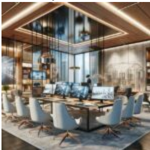
Innovation in Architecture Offices: Enhancing Creativity Through Technology and Environment