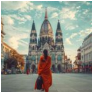
A Guide to Germany's Biggest Cities: Where to Study, Work and Explore!