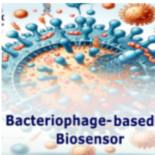
How can bacteriophage- based biosensors identify cancer quickly?