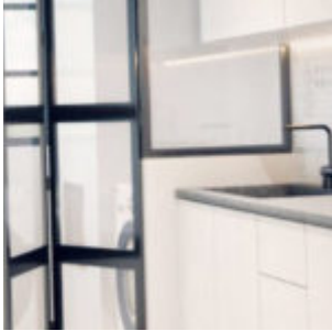
3D Rendering in Real Estate Sector