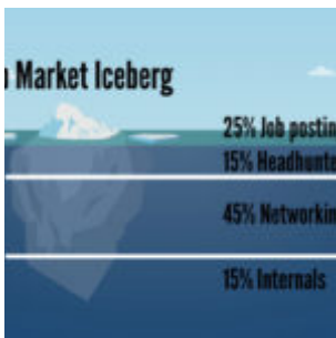
The Hidden Job Market