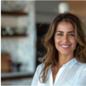
Exploring Career Opportunities in Locum Optometrist Jobs