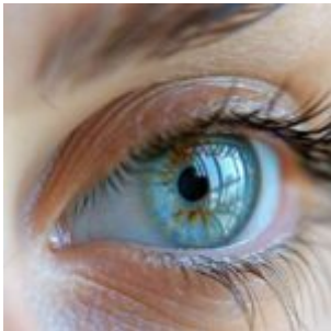
Acuvue Oasys: The Ultimate Guide to Comfort and Clarity