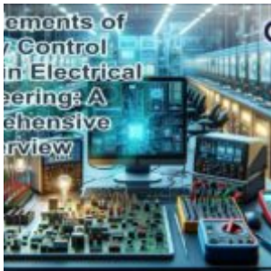
5 Key Elements of Quality Control Systems in Electrical Engineering: A Comprehensive Overview