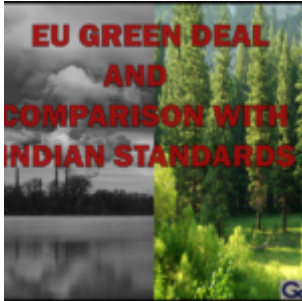
EU GREEN DEAL AND COMPARISON WITH INDIAN STANDARDS