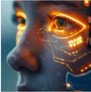
Mastering Job Interviews with AI and GPT-4: Tips and Techniques for Success