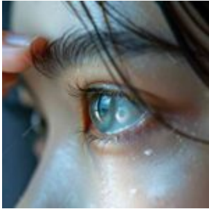
Silicone Hydrogel Contact Lenses: Benefits, Features, and Considerations