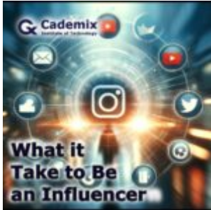
What It Takes to Be an Influencer