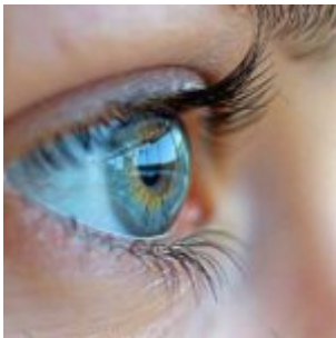
Colored Contacts Non Prescription: Enhancing Your Look Safely and Effectively