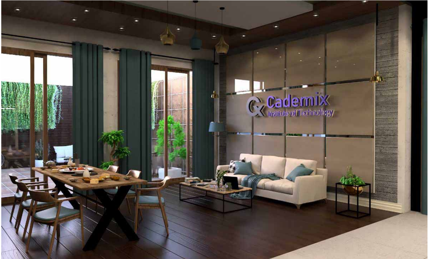
© Copyright Photo, Realistic Rendering by Shahrbanoo Rajabi, Cademix Institute of Technology, Austria.

Some individuals also choose to relocate the home office away from the front door, where guests may view it. The ideal spaces are those in which you can make a separation and give seclusion. The usefulness of the home office has developed as more homeowners work from home. In fact, many families are discovering that having just one home office is insufficient.