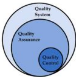
Quality Assurance & Quality Control