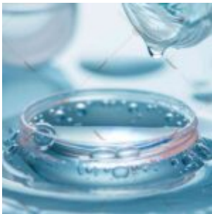
Acuvue for Astigmatism: Advantages and Disadvantages