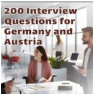
200 Interview Questions for Germany and Austria