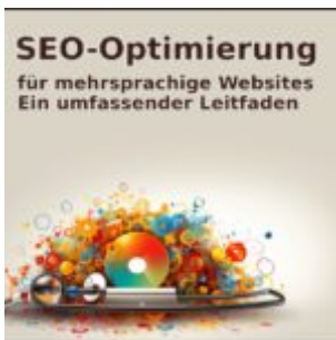
SEO-Optimierung für mehrsprachige Websites: Ein umfassender Leitfaden