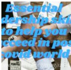
Essential leadership skills to help you succeed in post covid world