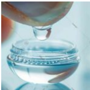
OptiFree PureMoist: Enhancing Contact Lens Comfort and Hygiene