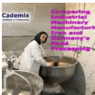
Comparing Industrial Machinery Manufacturing Iran and Germany's Food Processing