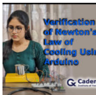
Verification of Newton's Law of Cooling Using Arduino