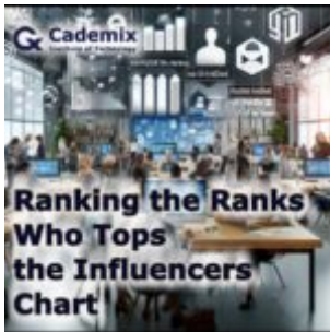
Ranking the Ranks: Who Tops the Influencer Charts?