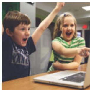
Colored Eye Contacts: A Fun Guide for Kids to Understand and Use Safely