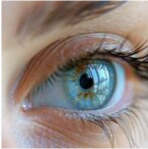
Acuvue Oasys: The Ultimate Guide to Comfort and Clarity