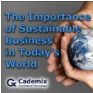
The Importance of Sustainable Business in Today's World