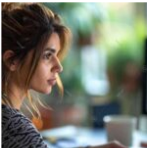
The Cognitive Biases Behind Misinterpreting Job Offers