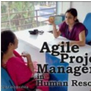
HR Agile Management - Agile Project Management in Human Resource