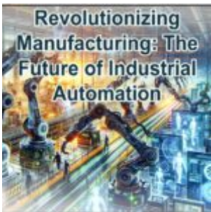
Revolutionizing Manufacturing: The Future of Industrial Automation