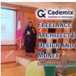
Freelance Architect Job, Design and Make Money