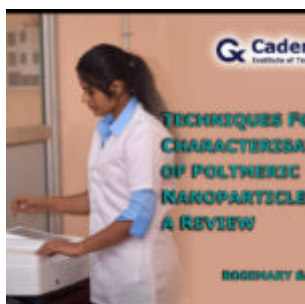
Techniques for Characterisation of Polymeric Nanoparticles: A Review