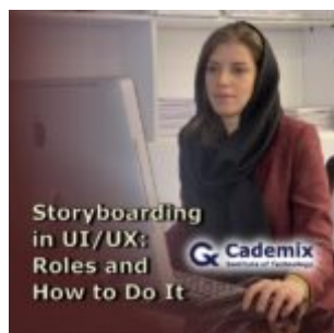
Storyboarding in UI/UX: Roles and How to Do It