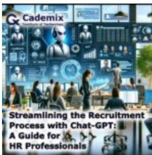
Streamlining the Recruitment Process with Chat-GPT: A Guide for HR Professionals