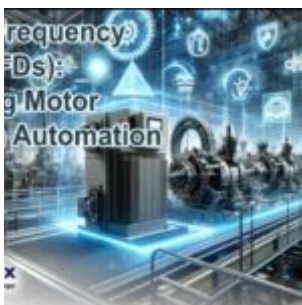
Variable Frequency Drives (VFDs): Enhancing Motor Control in Automation