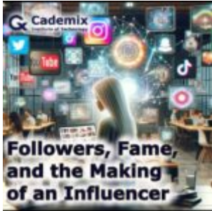
Followers, Fame, and the Making of an Influencer