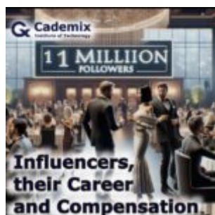
Influencers, their Career and Compensation