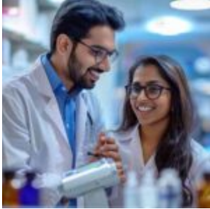
Optometrist Employment: A Guide for International Job Seekers