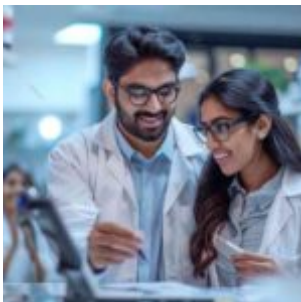
Optometrist for Hire: A Comprehensive Guide for Employers and Job Seekers