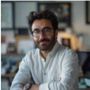
Legal Careers in Europe: Opportunities for International Lawyers