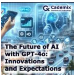
The Future of AI with GPT-4o: Innovations and Expectations