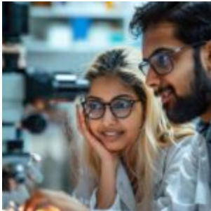
Optometry: A Comprehensive Guide