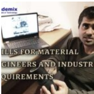
Skills for material engineers and industrial requirements