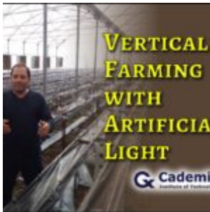
Vertical Farming with Artificial Light: Review and Future Advancement