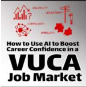
How To Use AI To Boost Career Confidence In A VUCA Job Market