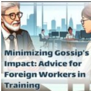
Minimizing Gossip's Impact and Advice for Foreign Workers in Training