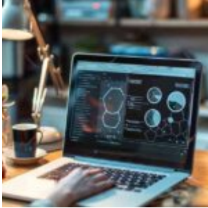
Comprehensive Guide to Canva Resume Templates: How to Create and Use Them Effectively