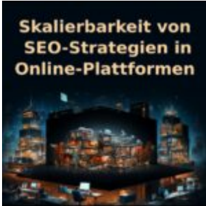
Skalierbarkeit von SEO-Strategien in Online-Plattformen