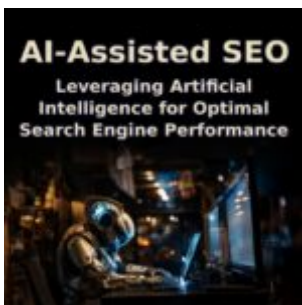
AI-Assisted SEO: Leveraging Artificial Intelligence for Optimal Search Engine Performance