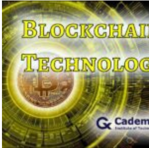
Blockchain as a Service(BaaS)- Trending Blockchain Technology Platform