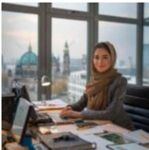
Protecting Candidates: Navigating the Legal Minefield of Job Offers