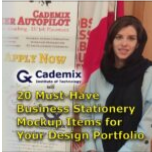
20 Must-Have Business Stationery Mockup Items for Your Design Portfolio