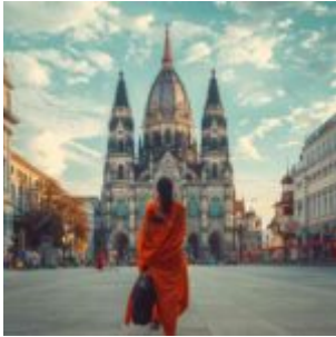
A Guide to Germany's Biggest Cities: Where to Study, Work and Explore!