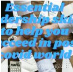
Essential leadership skills to help you succeed in post covid world