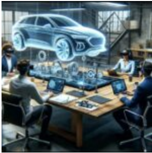
Effective Multi-Platform Communication: Integrating Email, WhatsApp, and Other Messaging Platforms