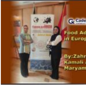
Food Additives in Europe