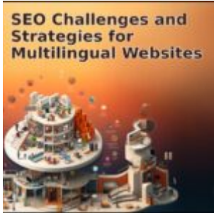
SEO Challenges and Strategies for Multilingual Websites