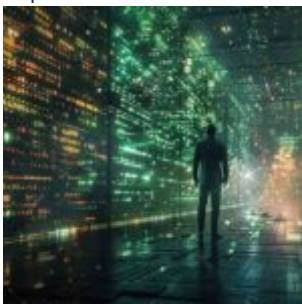
Enhancing User Search Behavior Understanding Through Reflective Search Intent