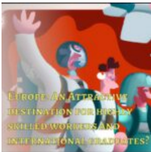
Why Europe is very attractive destination for highly skilled workers and international tech graduate...