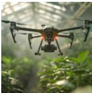
In-Depth Review of AgriSpray Drones: Specifications, Advantages, Disadvantages, and Leading Vendors