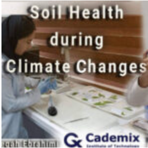
Soil Health during Climate Changes