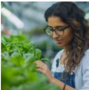
Embracing Organic Farming: A Journey Towards Sustainable Agriculture