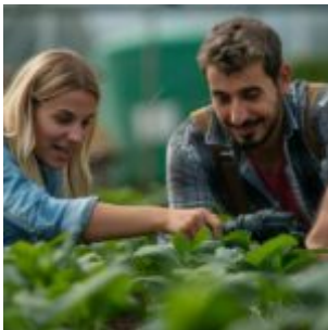
An Academic Intro to Agribusiness: Bridging the Gap Between Academia and the Agricultural Market