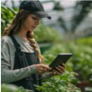
A Comprehensive Analysis of Agricultural Land: Tools, Methods, and Policies for Researchers and Poli...