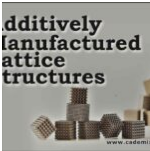
Additively Manufactured Lattice Structures