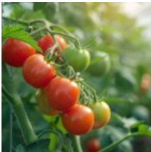
Sustaining Tradition: The Role and Evolution of the Family Farm