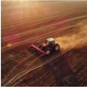
Buying FarmLand for Sale by Owner, A Comprehensive Guide