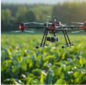
Navigating New Technology in Agriculture: Insights from the Hype Cycle and Future Trends