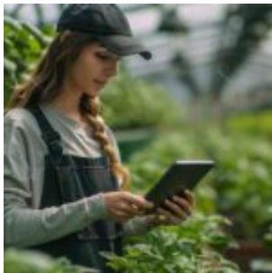
Exploring Career Opportunities with USDA Jobs: A Comprehensive Guide for Job Seekers and Advisors