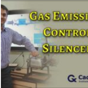
Gas Emission Control Silencer