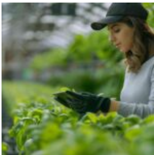
Navigating Ag Recruitment: Comprehensive Strategies for Securing Top Talent in Agriculture