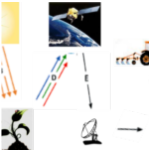
Precision Farming System: Revolutionizing Agriculture with Technology