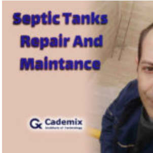
Septic Tanks - Repair and Maintenance