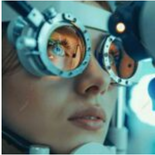
Astigmatism: Insights and Treatment Options