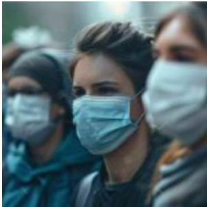
Impact of COVID 19 on the future of work