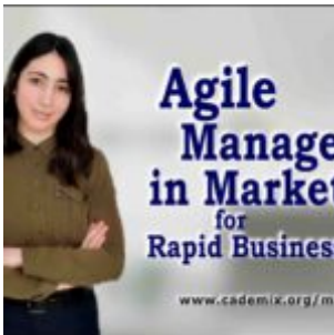
Agile Management in Marketing for Rapid Business Growth