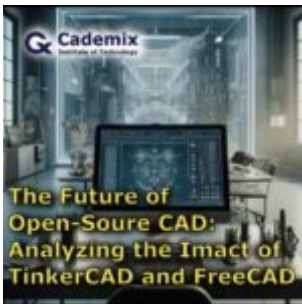
The Impact of TinkerCAD and FreeCAD in the Industry