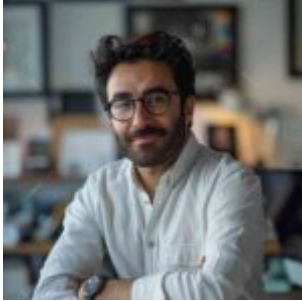
Legal Careers in Europe: Opportunities for International Lawyers