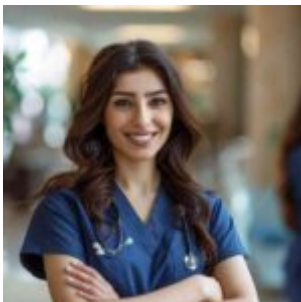
Comprehensive Eye Care: A Complete Guide to Maintaining Healthy Vision