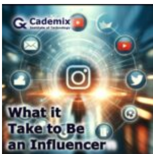
What It Takes to Be an Influencer