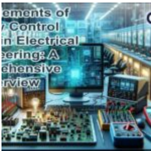
5 Key Elements of Quality Control Systems in Electrical Engineering: A Comprehensive Overview