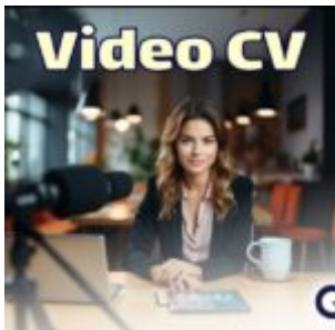
Video CV: 2023 Strategic Approach to Stand Out in the Competitive Job Market