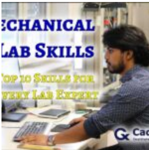
Mechanical and Lab Skills - Top 10 Skills for Every Lab Expert