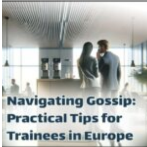
Navigating Gossip: Practical Tips for Trainees in Europe