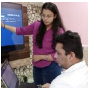
Information Technology & Collaboration: The Key to thrive business teams