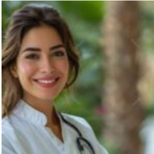
The Comprehensive Guide to Finding the Best Eye Doctor