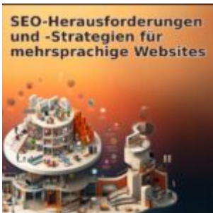
SEO-Herausforderungen und -Strategien für mehrsprachige Websites