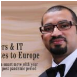
Engineers & IT Graduates to Europe: Art of making a smart move with your career during post pandemic...