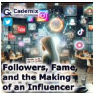
Followers, Fame, and the Making of an Influencer