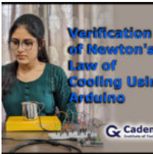
Verification of Newton's Law of Cooling Using Arduino