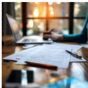
Comprehensive Guide to Good Resume Templates: How to Choose and Use Them Effectively