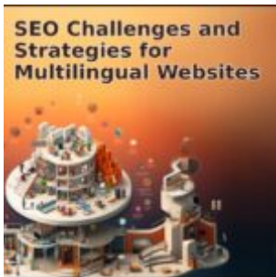
SEO Challenges and Strategies for Multilingual Websites