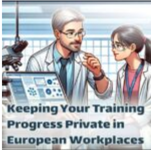
Keeping Your Training Progress Private in European Workplaces