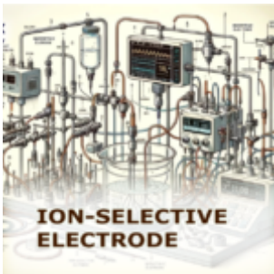
How do Ion-Selective Electrodes Regulate Diseases? A Comprehensive Review