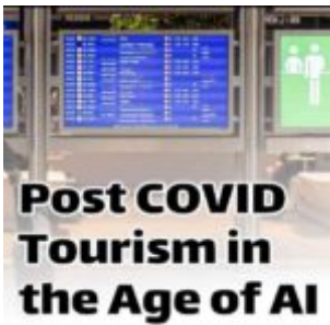
Post-COVID Tourism in the Age of AI