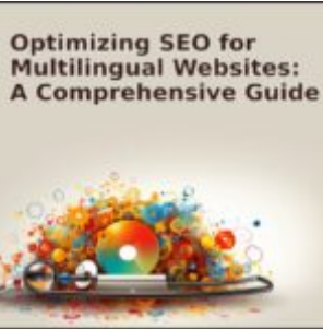
Optimizing SEO for Multilingual Websites: A Comprehensive Guide