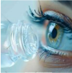
Prescription Colored Contact Lenses: Combining Aesthetics with Vision Correction