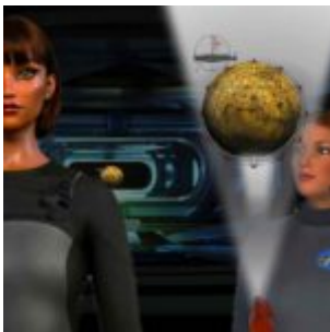
3D Holography and its Proven Industrial Applications