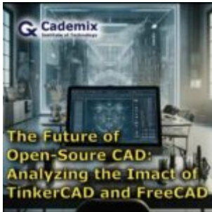
The Impact of TinkerCAD and FreeCAD in the Industry