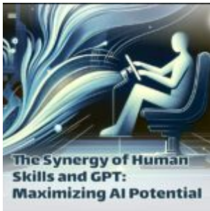
The Synergy of Human Skills and GPT-4o: Maximizing AI Potential