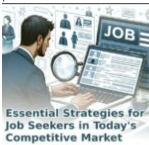
Essential Strategies for Job Seekers in Today's Competitive Market