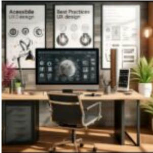
UX Design and Leveraging Art Principles in Web Design