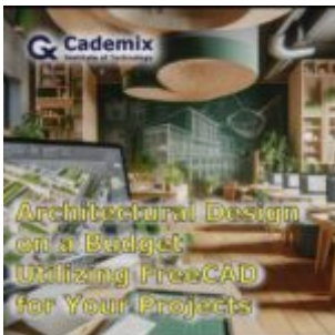
Architectural Design on a Budget: Utilizing FreeCAD for Your Projects