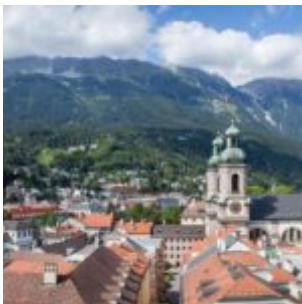
Hospitality and Tourism Careers in Europe: Navigating the Job Market