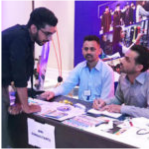
Austria : Top destination for Pakistani graduates