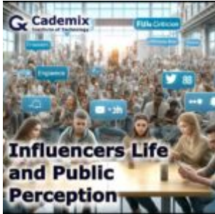
Influencers Life and Public Perception