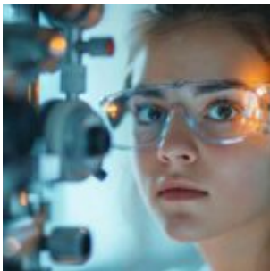
RX Safety Glasses: Protecting Your Vision with Style and Function