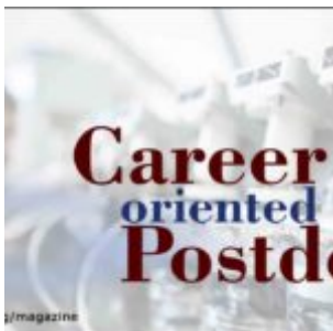
Career Oriented Postdocs