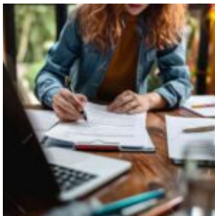
Conditional Offers and Legal Pitfalls: Ensuring Fairness in Recruitment