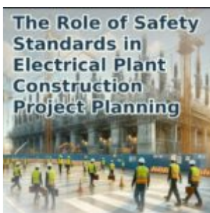
The Role of Safety Standards in Electrical Plant Construction Project Planning: 2024 Update