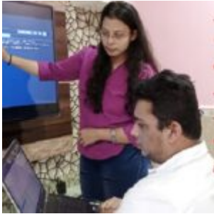
Information Technology & Collaboration: The Key to thrive business teams