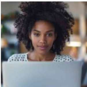
3D Rigging of Logos for Character Animation: Practical Steps