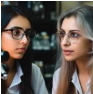
Refractometry: Essential Tool in Optometry