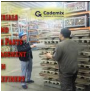
Spare Parts Management in Refinery