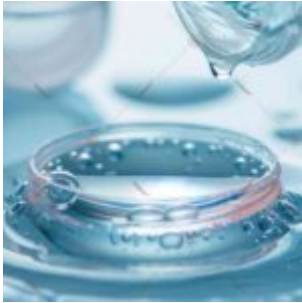
Acuvue for Astigmatism: Advantages and Disadvantages