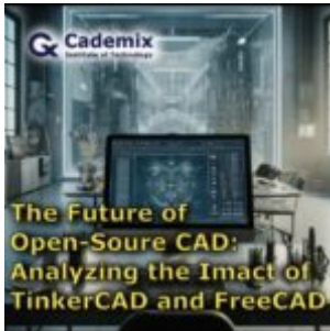
The Impact of TinkerCAD and FreeCAD in the Industry