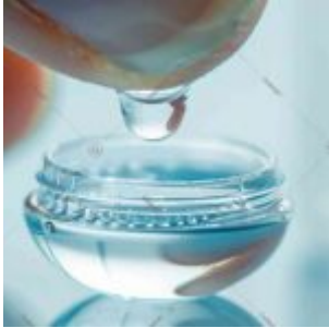
OptiFree PureMoist: Enhancing Contact Lens Comfort and Hygiene