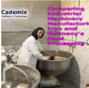
Comparing Industrial Machinery Manufacturing Iran and Germany's Food Processing