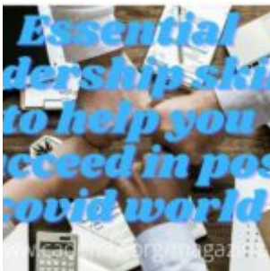
Essential leadership skills to help you succeed in post covid world