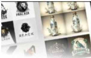
Revolutionizing Logo Design The Creative Power of AI