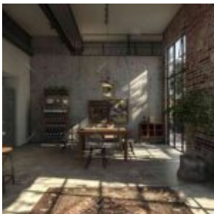
Innovative Techniques in Interior Design: Combining Functionality and Aesthetics