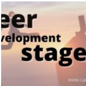
Career Development Stages