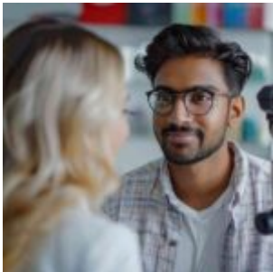
Exploring Career Opportunities in Optician Jobs: A Detailed Guide