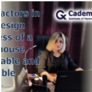
The factors in the design process of a tiny house habitable and portable