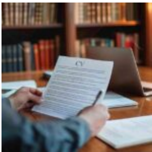
Why "CV Template PDF" Isn't What You Need: The Right Way to Create an Editable CV