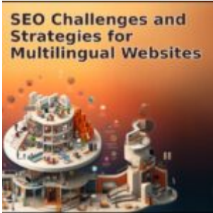
SEO Challenges and Strategies for Multilingual Websites