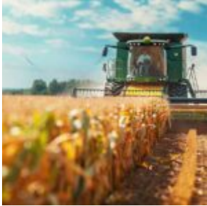
Climate Smart Agriculture: Strategies, Practices, and Policies for Sustainable Development