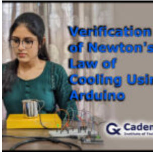
Verification of Newton's Law of Cooling Using Arduino