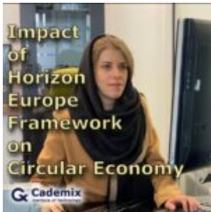
Impact of Horizon Europe Framework on Circular Economy