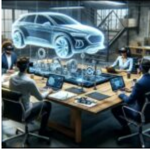
Effective Multi-Platform Communication: Integrating Email, WhatsApp, and Other Messaging Platforms