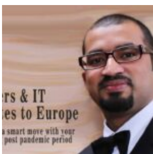
Engineers & IT Graduates to Europe: Art of making a smart move with your career during post pandemic...