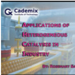
Applications of Heterogeneous Catalysis in Industry