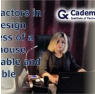
The factors in the design process of a tiny house habitable and portable