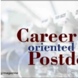
Career Oriented Postdocs