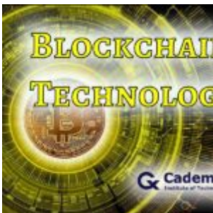
Blockchain as a Service(BaaS)- Trending Blockchain Technology Platform