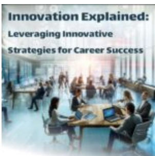
Innovation Explained: Leveraging Innovative Strategies for Career Success