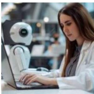
GPT-4 for Employers: Enhancing Talent Acquisition and Management