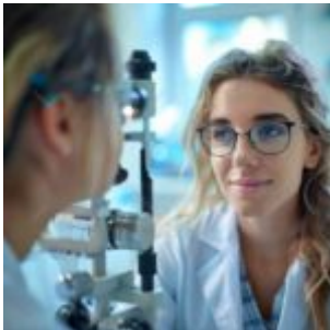
Exploring Ophthalmology: Comprehensive Eye Care from Diagnosis to Treatment