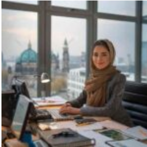
Protecting Candidates: Navigating the Legal Minefield of Job Offers