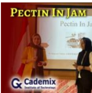
Pectin In Jam