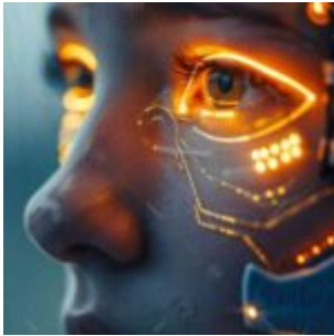
Mastering Job Interviews with AI and GPT-4: Tips and Techniques for Success