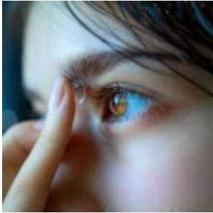
Monthly Contact Lenses: Balancing Convenience and Vision Health