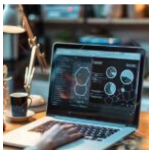
Comprehensive Guide to Canva Resume Templates: How to Create and Use Them Effectively