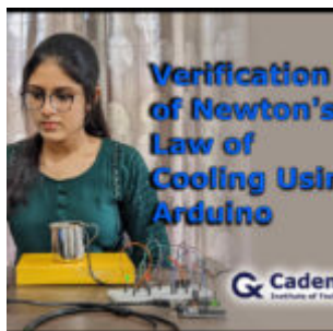
Verification of Newton's Law of Cooling Using Arduino