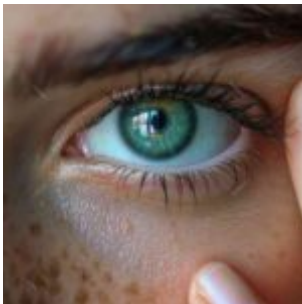
Exploring Contactlenses: A Detailed Look at Vision Correction and Eye Care