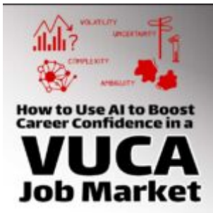
How To Use AI To Boost Career Confidence In A VUCA Job Market