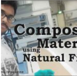
Enhancing of the Composite Materials using Natural Fibers