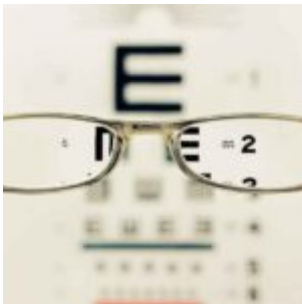
Eye Exams: Essential for Maintaining Vision and Eye Health