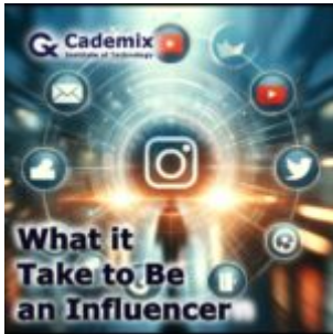
What It Takes to Be an Influencer