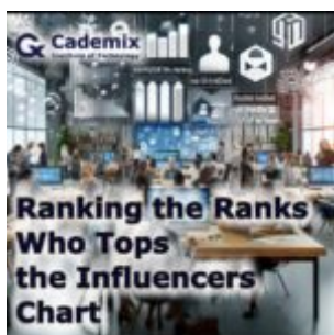
Ranking the Ranks: Who Tops the Influencer Charts?