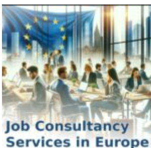
Job Consultancy Services in Europe