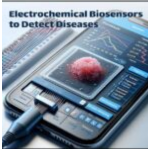
Electrochemical Biosensors: Revolutionizing Point of Care Diagnostics- An Overview