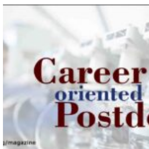
Career Oriented Postdocs