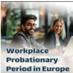
Workplace Probationary Period in Europe Workplace Probationary Period in Europe: 2024 Update Guide for International Job Seekers