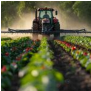
Powering the Fields: The Evolution and Impact of Farm Tractors