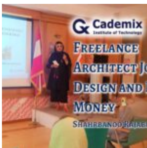
Freelance Architect Job, Design and Make Money