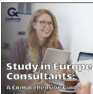
Study in Europe Consultants: A Comprehensive Guide