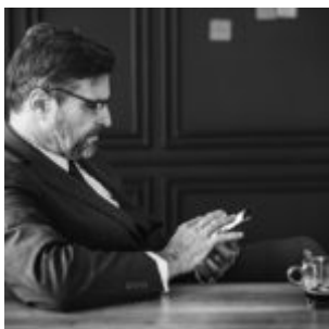
Establishing an Eye Center: Business Models and Key Considerations for Business Owners and Investors