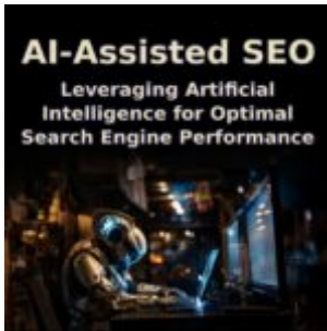
AI-Assisted SEO: Leveraging Artificial Intelligence for Optimal Search Engine Performance